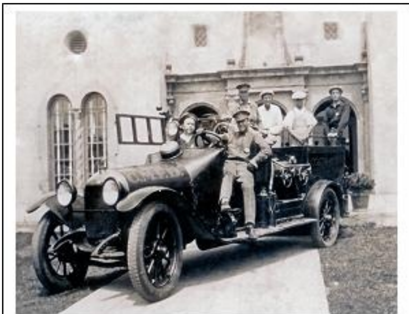
CMFD Chemical Wagon, April 1929