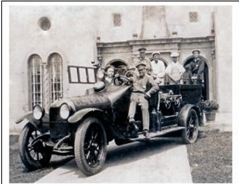
CMFD Chemical Wagon, April 1929