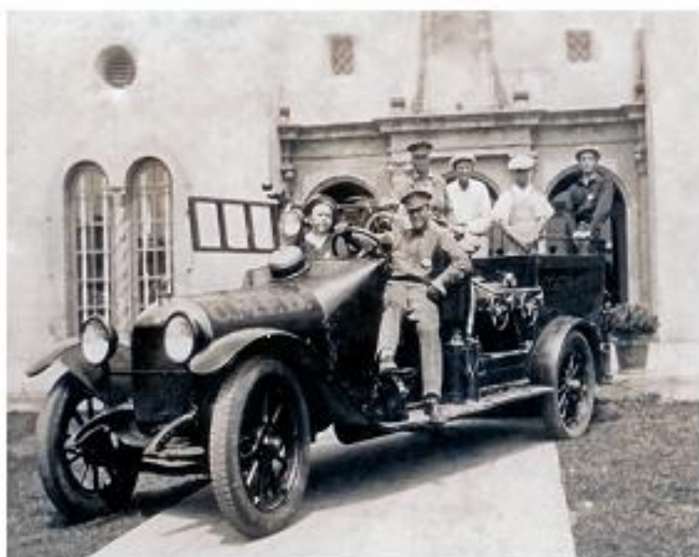
CMFD Chemical Wagon, April 1929